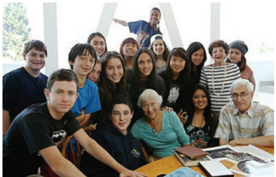
Participants from the Righteous Conversations 2012 PSA Workshop at Harvard-Westlake School