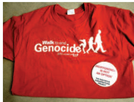
Walk to end Genocide T-Shirt with a Righteous Conversations Button